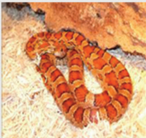
Corn Snake Pantherophis guttatus St. Thomas