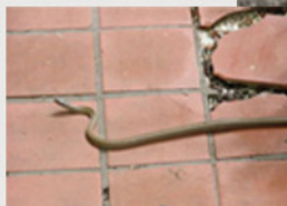
Puerto Rican Racer Borikenophis portoricensis St. Thomas / St. John