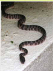
Virgin Islands Tree Boa Chilabothrus granti St. Thomas