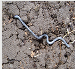
Flowerpot Blind Snake Indotyphlops braminus St. Thomas / St. John / St. Croix